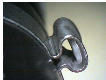
Made with Forming Jaws: Great Ear Form. Smooth, low profile, and no stress

One last thing to consider, did you notice how tool jaws generate a distinct Ear profile and leave behind either unique tool marks, or smooth rounded surfaces. These are features that insurance company technicians commonly look for when reviewing any warrantee claim. Murray recommends using only forming type tools for Pinch Ear type clamps.