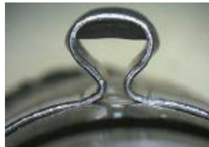
Made with Cutting Jaws