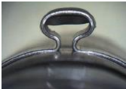
Made with Forming Jaws

While you may have thought that sharp jaws automatically equate to tighter clamps, let’s look at the finished product. Below are identical clamp installations: one made with Forming Jaws and the other with Cutting Jaws. Take note of the Ear profiles, especially the height.