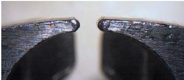
Forming Jaws correct for Pinch Clamps

In recent years, there has been an influx of low-price tools coming to market and although the low price may seem attractive using the wrong tool for Pinch-Clamp installation could be a costly proposition. Below, shown left, are tool jaws manufactured specifically for Pinch-Clamp installation. In contrast, below shown right, are low cost (cutting) jaws.