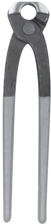
HAND INSTALLATION TOOL A2000